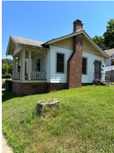
Ernest Green House